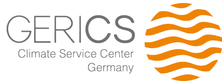
Wiebke Schubotz Hamburg, Germany